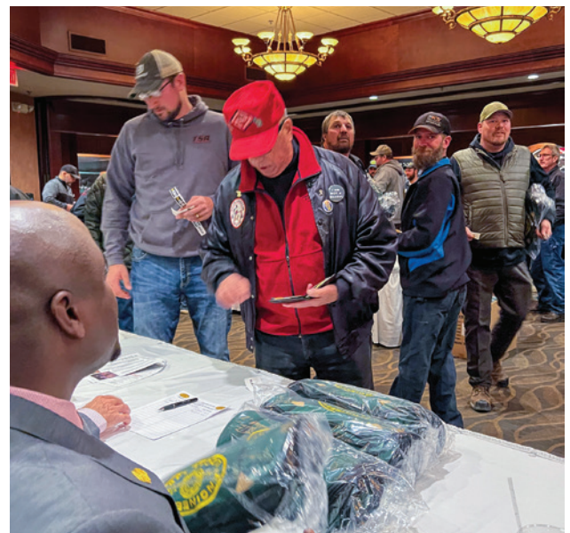
Members registering for the Green Bay Christmas meeting.