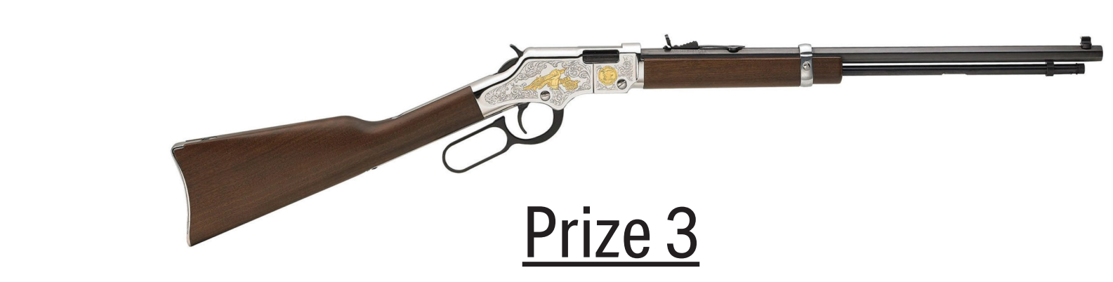
Henry® Second Amendment Tribute Edition