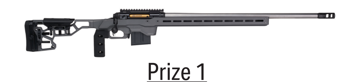
Savage<sup>®</sup> 110 Elite Precision<sup>™</sup>

Drawing to be held at the Local 139 General Membership meeting beginning at 10 a.m. on Saturday, January 8, 2022 at the Madison Hall, 4702 S. Biltmore Lane, Madison, WI 53718. You need not be present to win. The odds of winning are determined by the number of entries. All prizes made in America.